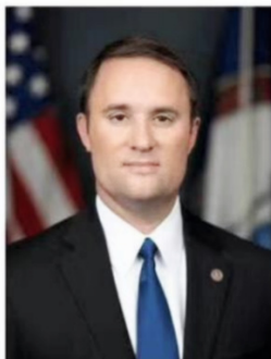
Jason S. Miyares Attorney General

Dear SMART Education and Chinese American Parents Association of Northern Virginia,